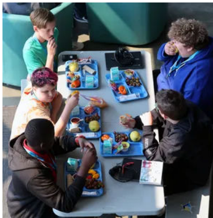
Freshman Catalyst Public Schools students eat their lunch in the main floor gathering area at the Marvin Williams Recreation Center in Bremerton on Thursday, Sept. 4, 2025.